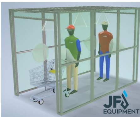
Figure 2: Sani-Tunn 1,5m entry large side nozzles

The Sani-Tunn structure has been created using either robust aluminium, or superior graded stainless-steel to withstand the volume of activity and traffic it would need to manage. Each unit is specifically designed to cater for the environment in which it will be used. A unique spray system - operated by sensors, comes complete with high pressure pump and nozzles, moves an approved sanitisation solution through stainless steel piping installed inside the tunnel. The approved solution then emits a quality approved sanitisation solution that works with all fabrics and synthetics – like trolleys or pushchairs and is hypoallergenic for sensitive skin and facial usage.